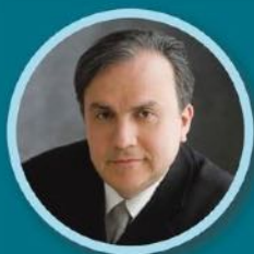
Yefim Bronfman Tuesday Recital