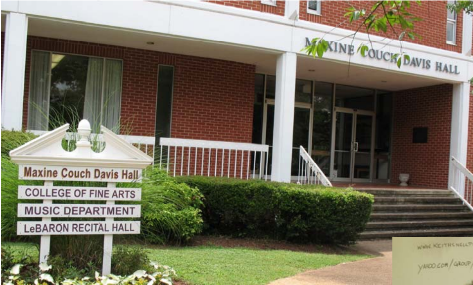
Left: Davis Hall, home of the Music Department and Le-Baron Recital Hall, University of Montevallo