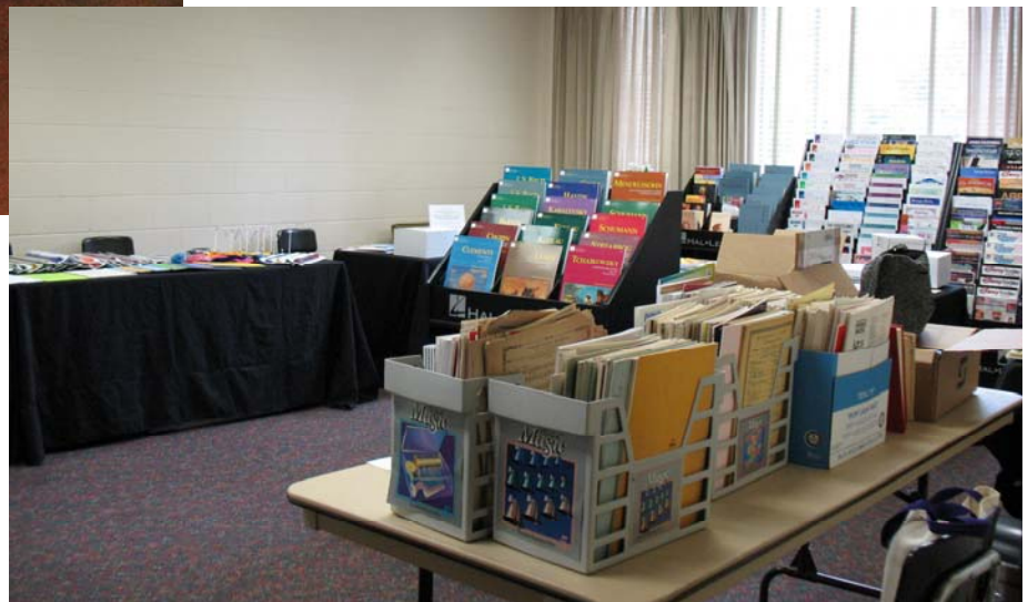
Right: Several fine vendors were represented at the Conference. Forefront was the Music Swap to benefit the Da Capo Fund.