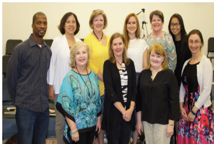
Pictured are teachers who were in attendance at the 2016 HMTA annual meeting.