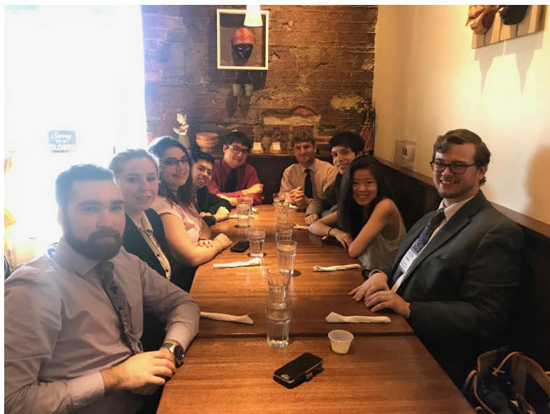
Pictured: University of Alabama at Huntsville Collegiate Members present at the 2019 Pedagogy Symposium and University of Alabama at Huntsville and University of Alabama students and alumni enjoy lunch together at the 2019 Pedagogy Symposium