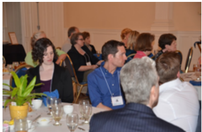
Enjoying the conference banquet