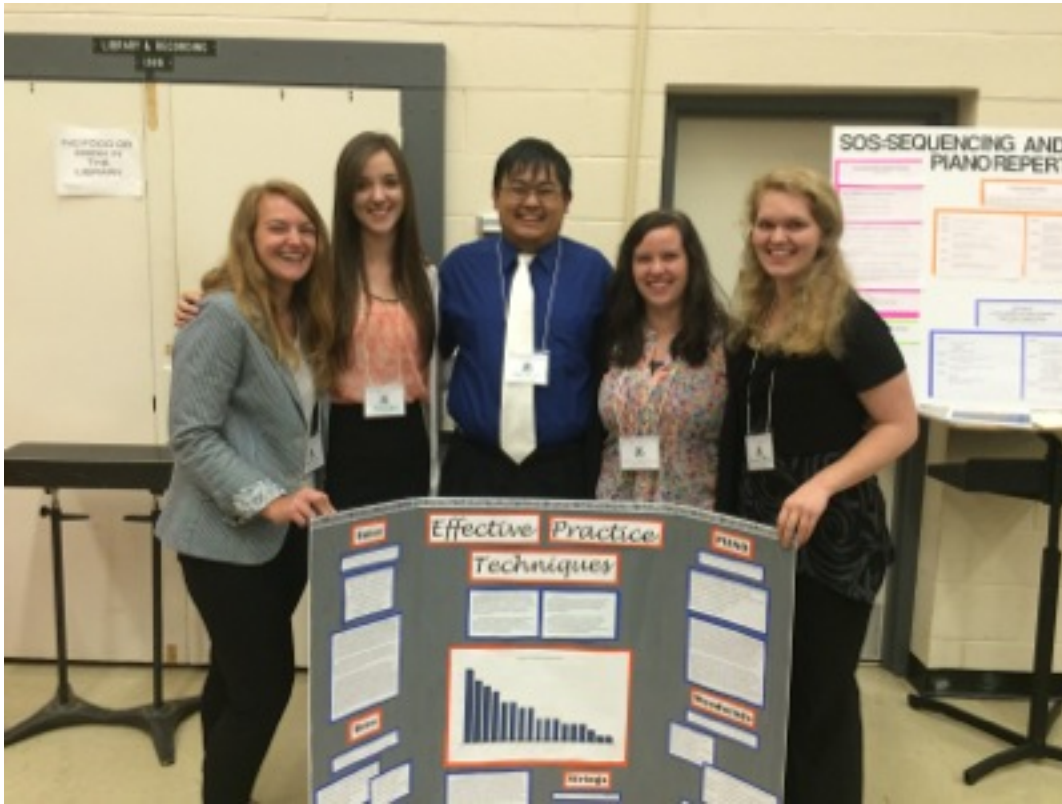
Auburn University Collegiate Chapter, 2015 Poster Presentation Winner