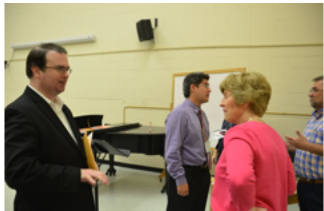
Networking with fellow AMTA colleagues