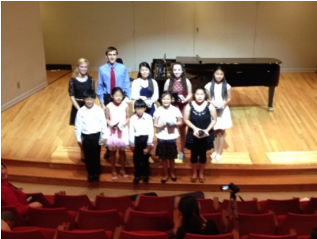
MTNA Winners and AMTA Chamber Music & Composition Winners