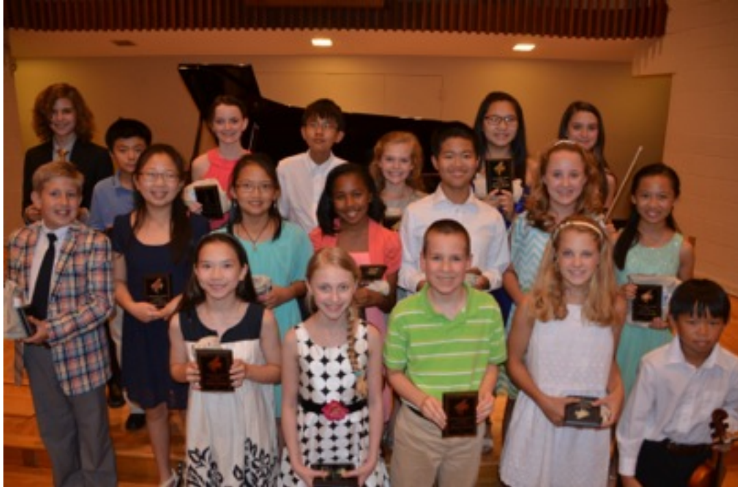
Division I Winner's Recital