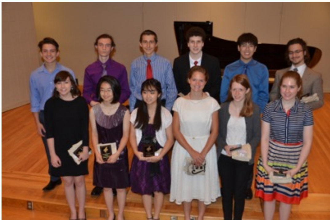
Division III Winner's Recital