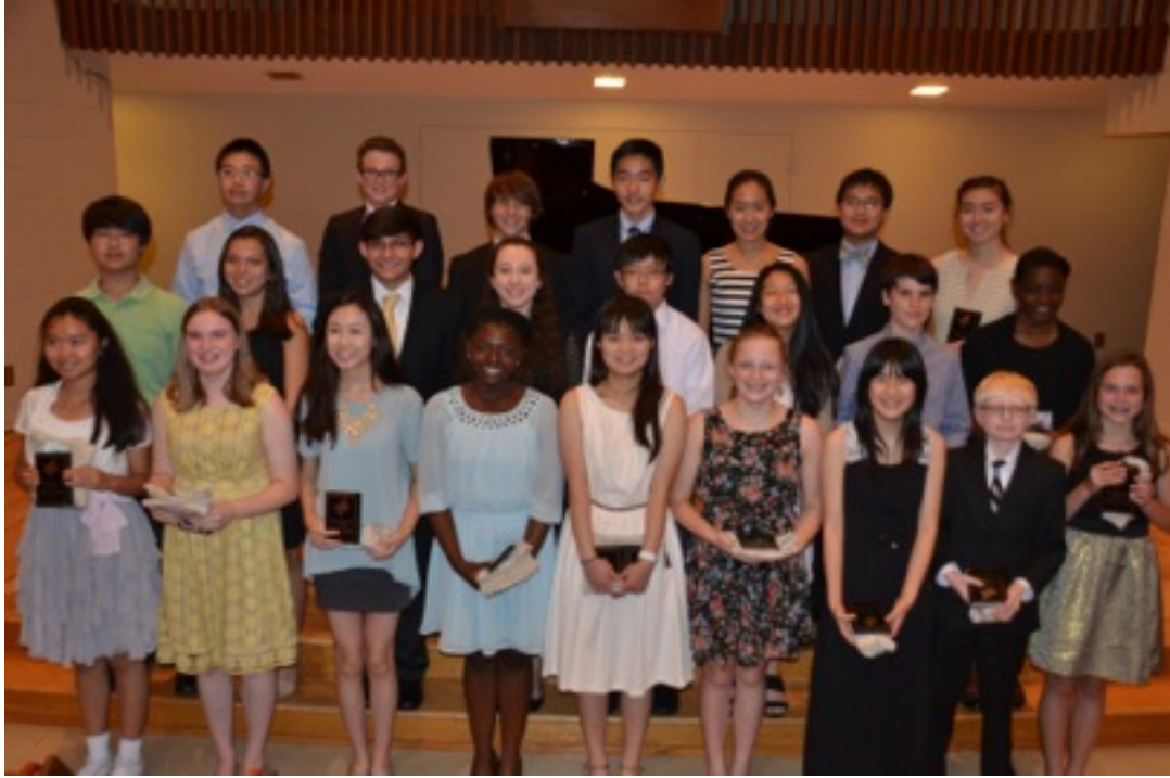
Division II Winner's Recital