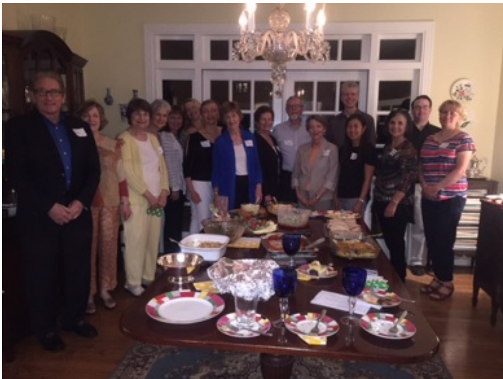
BMMF Potluck social—fun with fabulous food!